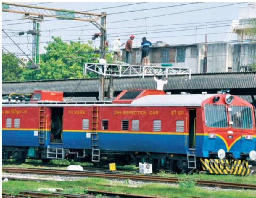
Electrification work in progress at the Basin Bridge yard near Chennai Central