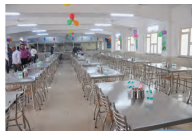
Renovated Canteen for employees of DLW