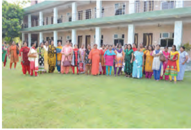
Staff Welfare Activities- Women empowerment camp for non-gazetted women employees of RDSO