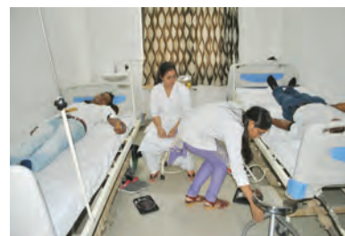
Blood Donation Camp, MCF