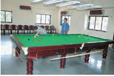
Facility of Indoor Sports at Mahalaxmi, Western Railway

to 30 days' emoluments for the year 2015-16. The PLB and ad-hoc bonus both were paid on an enhanced calculation ceiling of ₹7,000/- p.m.