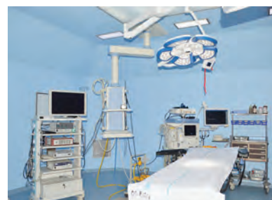
New operational theatre in Kasturba Gandhi Hospital, CLW