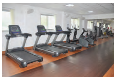
Renovated DLW Gymnasium and Health Club, DLW