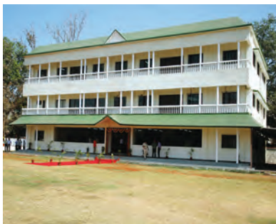
Staff Hostel at Mahalaxmi Western Railway