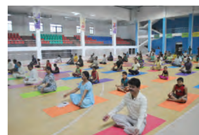
International Yoga Day, MCF

This benefitted an estimated 12.59 lakh railway employees. Group 'C' and 'D' RPF/RPSF personnel were sanctioned ad-hoc bonus equivalent