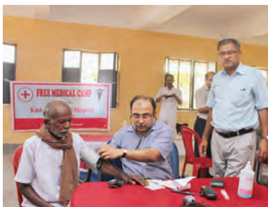
A scene of health check up camp under Rail Yatri Upbhokta Pakhwada in CLW

Co-operative societies of various types are functioning on Indian Railways. These Cooperative Societies are registered under the Multi-State Cooperative Societies Act, 2002 and are under overall Supervision of the Central Registrar of Cooperative Societies, Department of Agriculture & Coop., Krishi Bhawan, New Delhi. Railway Administration has no jurisdiction over the administrative, financial, managerial, appointment & service matters of the employees of the society. Railways only provide certain facilities & concessions to these Cooperative Societies as per the provisions of Chapter XXIII of IREM Vol. II. There are 42 Thrift and Credit Societies, 150 Railway men's Consumer Cooperative Societies, 24 Labour Cooperative Societies and 6 Railway men's Housing Societies functioning on Indian Railways during 2015-16.