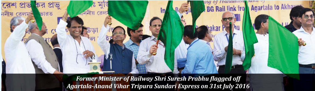
Former Minister of Railway Shri Suresh Prabhu flagged off Agartala-Anand Vihar Tripura Sundari Express on 31st July 2016

On 31 st July 2016, Tripura entered the Broad Gauge railway Map of India after waiting for decades. Former Minister of Railways Shri Suresh Prabhu flagged off Agartala-Anand Vihar Tripura Sundari Express.