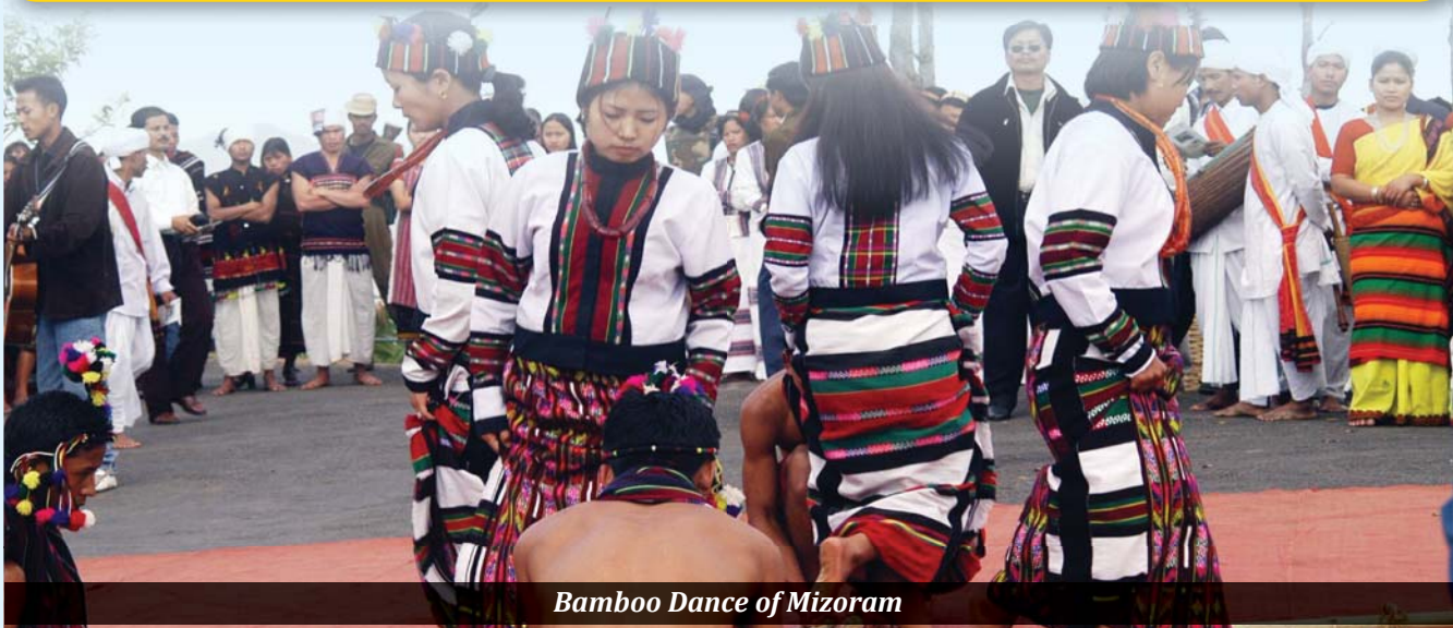
Bamboo Dance of Mizoram

All stations provided with 100% LED lighting