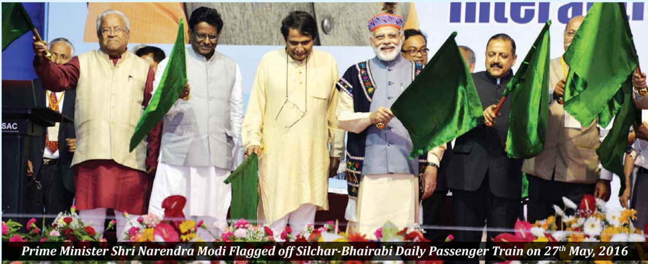
Prime Minister Shri Narendra Modi Flagged off Silchar-Bhairabi Daily Passenger Train on 27 th May, 2016