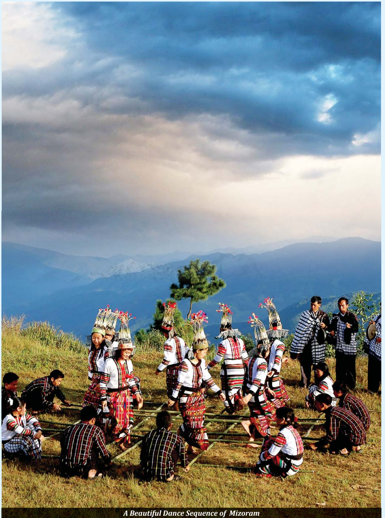
A Beautiful Dance Sequence of Mizoram