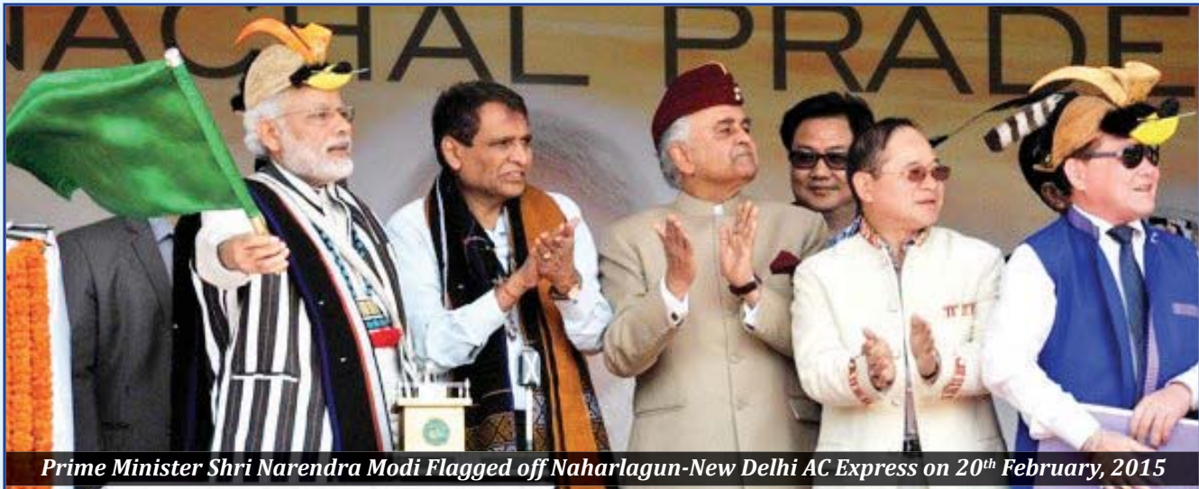
Prime Minister Shri Narendra Modi Flagged off Naharlagun-New Delhi AC Express on 20 th February, 2015