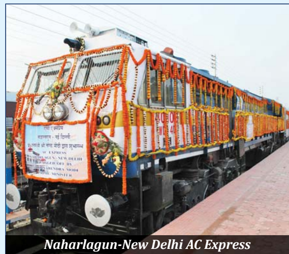
Naharlagun-New Delhi AC Express