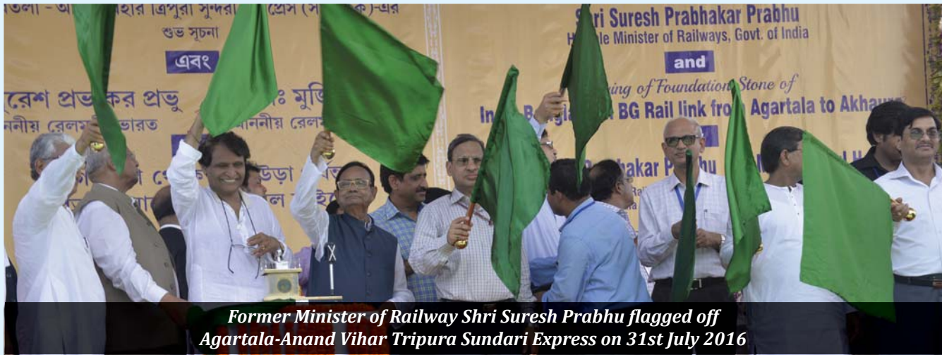
Former Minister of Railway Shri Suresh Prabhu flagged off Agartala-Anand Vihar Tripura Sundari Express on 31st July 2016

On 31 st July 2016, Tripura entered the Broad Gauge railway Map of India after waiting for decades. Former Minister of Railways Shri Suresh Prabhu flagged off Agartala-Anand Vihar Tripura Sundari Express.