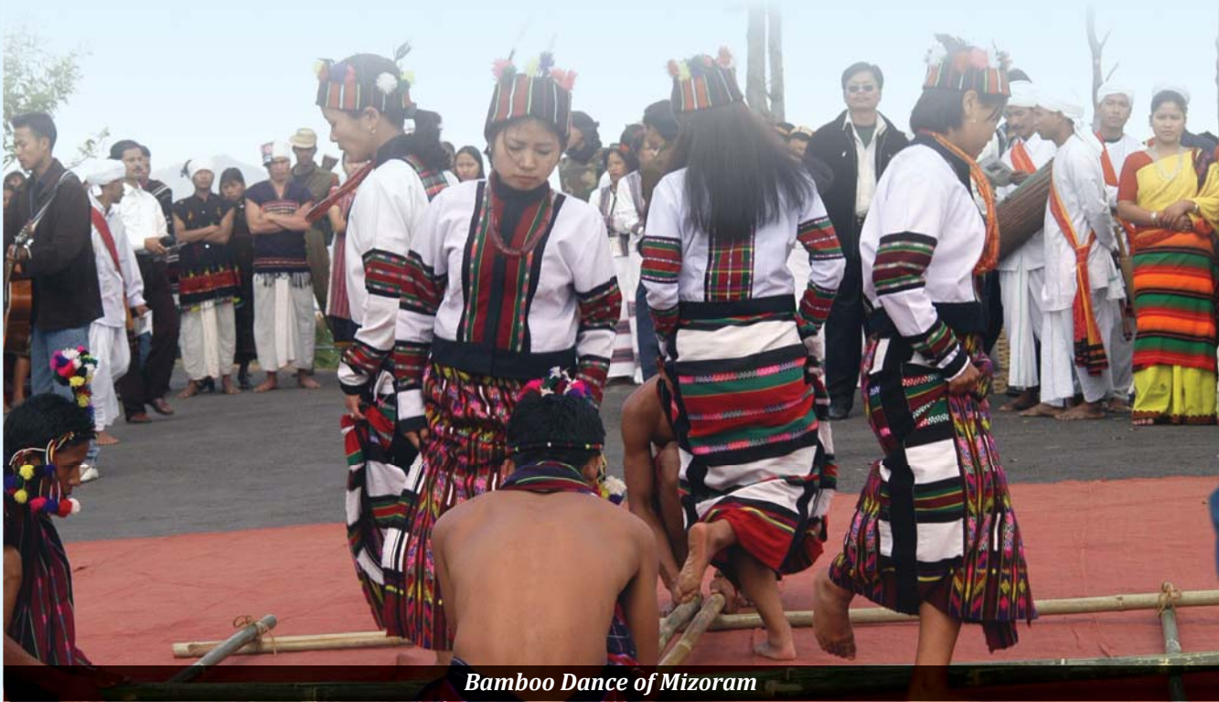
Bamboo Dance of Mizoram