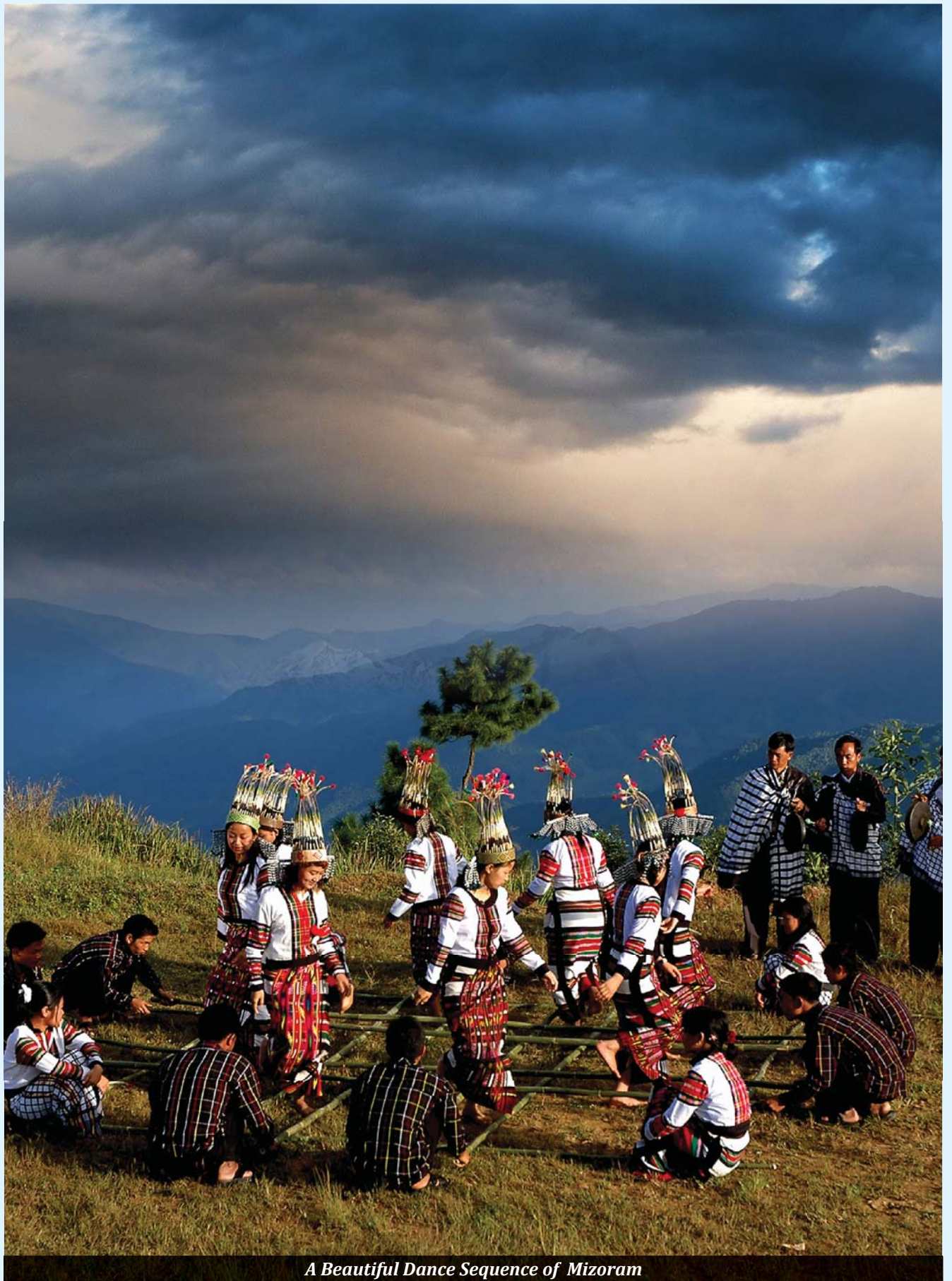
A Beautiful Dance Sequence of Mizoram