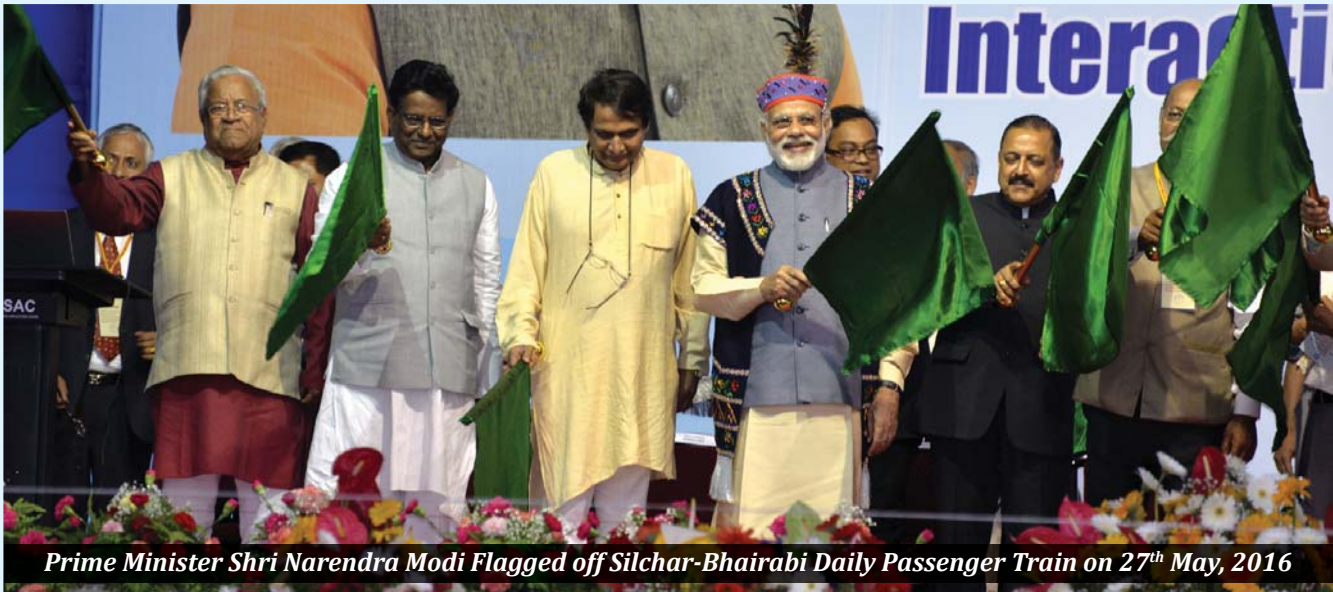
Prime Minister Shri Narendra Modi Flagged off Silchar-Bhairabi Daily Passenger Train on 27 th May, 2016